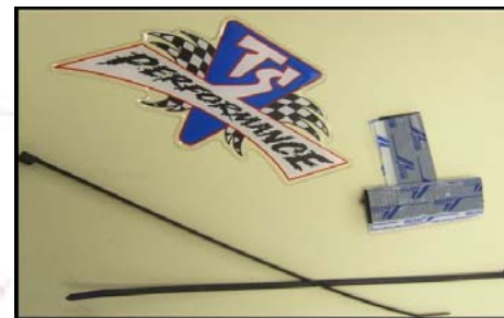
zip ties, velcro

5425 Nashville Road, Bowling Green, KY p. 270-746-9999 f 270-746-9170 www.tsperformance.com