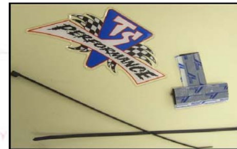
Sticker, zip ties, velcro

Bowling Green, KY 42101 270-746-9999 www.tsperformance.com