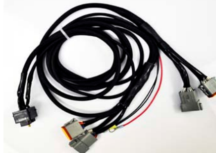
Caterpillar Acert Harness